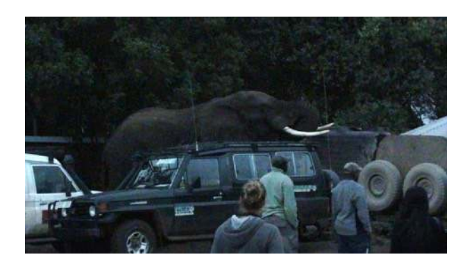
This big guy is a regular "drinker" at the Simba-A Campsite (pictured quenching his thirst from a water tank; Ngorongoro Crater, Tanzania).

Africa can be a wild continent where dangerous cats run free and hippos live in the rivers. But it's not completely wild. There are no lions on the airport runway and no rhinos wandering through