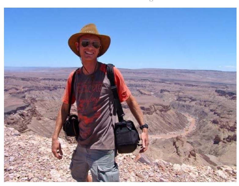
My "Rogue" Safari hat is a must-have on any adventure. Especially when it's blazing hot, like at the Fish River Canyon (Namibia).

and provide excellent shade cover. For guys, Panama hats or sturdy real leather cowboy hats are a little more chic than the standard fare sold at the airports.